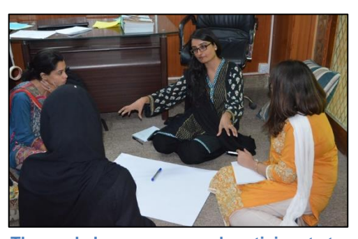
The workshop encouraged participants to identify key issues in Pakistan related to education and lifelong learning, leading to the identification of target audiences and main communication messages.