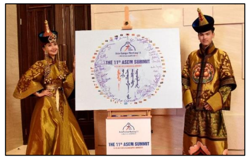
The theme of the AEPF11, held in Mongolia, was 'Building New Solidarities: Working for Inclusive, Just, and Equal Alternatives in Asia and Europe'.

The program was structured around three goals - (1) To set the context and analyses and introduce the seven themes for discussions for the duration of the meeting. (2) The workshops were organised to deepen and broaden the themes,