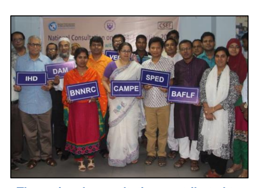
The national consultation contributed to strengthening interactions among ASPBAE's accredited members in Bangladesh and opened a window for increased collaboration.

Some recommendations to ASPBAE were to prioritise skill development; promote education as a key to achieving other development goals; and give more emphasis to research, documentation, and dissemination of research findings for advocacy.