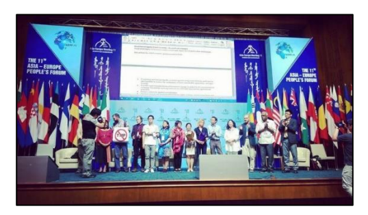
Discussions at the Forum workshops showed how Mongolia's socio-economic and political governance issues related to major concerns in both Asian and European countries.

Representatives of AFE Mongolia, an ASPBAE member, participated in the Forum. They pressed for the government to ensure the right to education for all, transparency, accountability, and meaningful participation, They also called for action against privatisation of public services, including education.