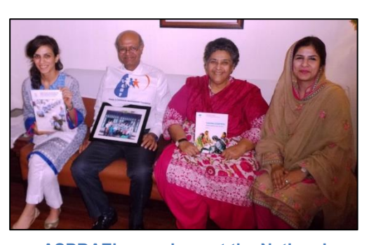
ASPBAE's members at the National Consultation in Lahore.