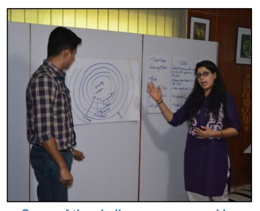
Some of the challenges expressed by participants, many of them communications focal persons in their organisations, were gathering information for dissemination, and pushing for communications to be prioritised in organisational set-ups.