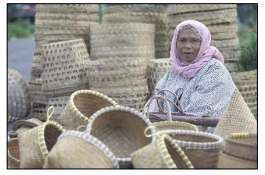
Participants of the national consultation stressed that the right to education of all Indonesians can be guaranteed if the government invested in lifelong learning.

To strengthen the advocacy around SDGs amongst members of ASPBAE, the participants suggested that materials disseminated by ASPBAE should be