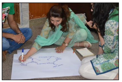
One of the aims of the communications workshop in Islamabad was to build support amongst PCE, its members, and partners for a strategic communications plan and activities.