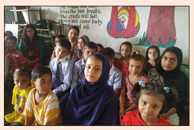
Young students of the Bunyad-e-Fatima School in Mandiawala, Lahore, Pakistan. The school was started with the aim to increase the economic potential of vulnerable families involved in bonded or exploitative forms of labour.