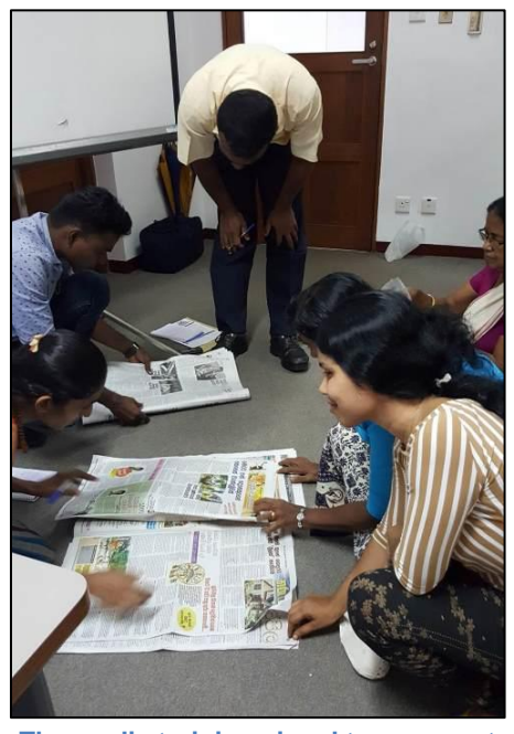
The media training aimed to, amongst other things, train select youth and women to identify issues related to education in the districts and link with professional journalists and garner their support for advocacy and lobbying to achieve the SDG 4 targets.